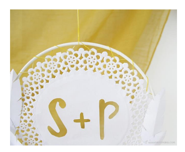
Will you make this paper doily dreamcatcher to decorate your own party or will it be a present for loved ones? Either way it will be an eye-catcher!

5. Add some yarn to hang the paper doily dreamcatcher. Done.